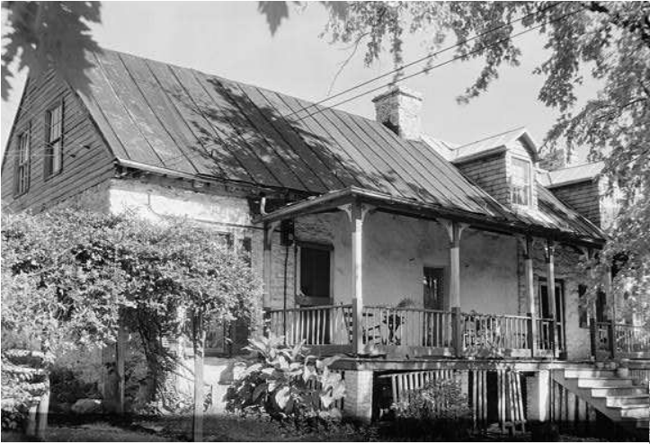
White House Farm in about 1933