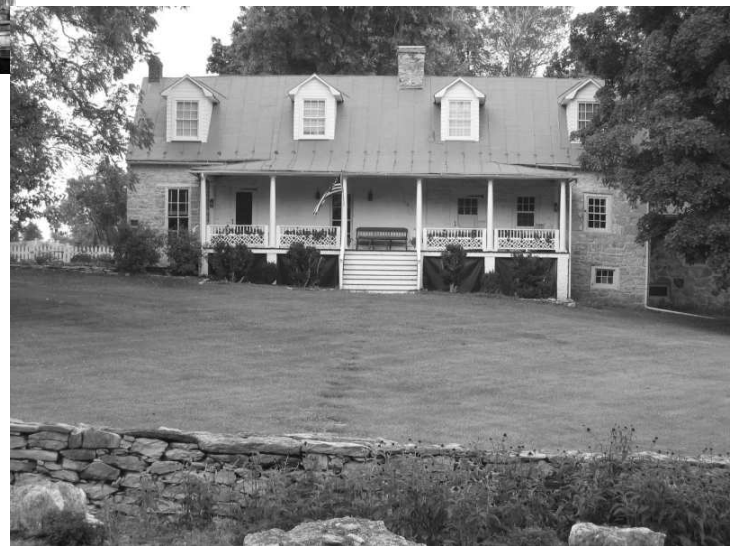
White House Farm in 2008